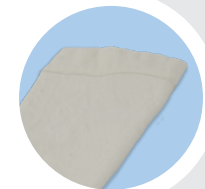
TURN DOWN CUFF