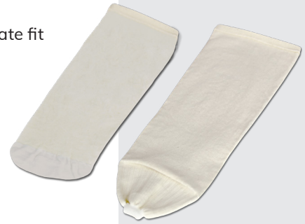
Stretch Spacer Sock with Nylon Toe (left) and Stretch Spacer Sock Hole-in-Toe with Reinforced Toe (right)